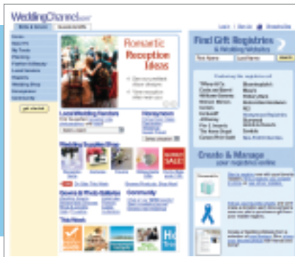
WeddingChannel.com home page

Prices in addition to Local Online Listing Rate subject to change without notice.